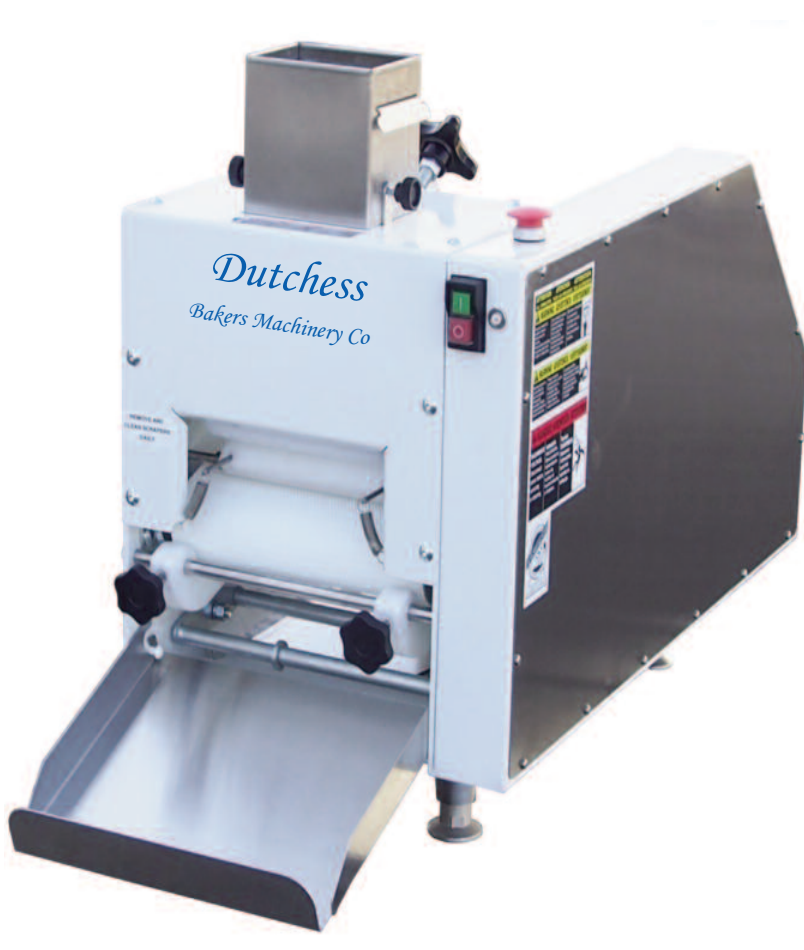
Shown with Side Guides and no Moulding Plate

Specifications subject to change without notice